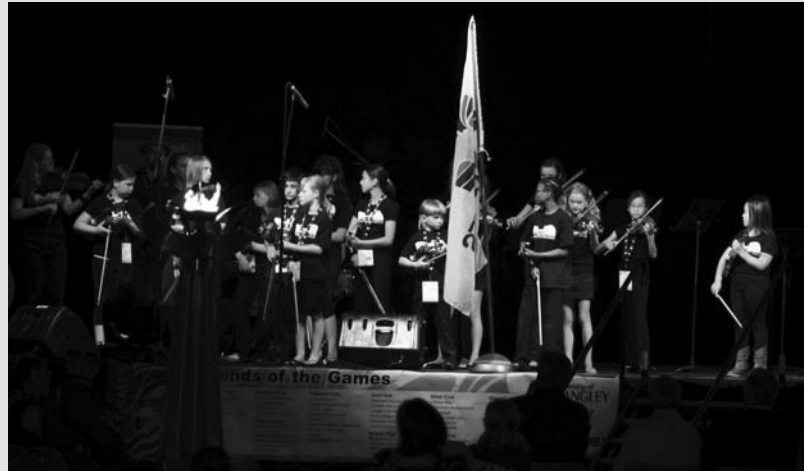
LCMS Fiddlers entertain the crowd at the BC Summer Games Closing