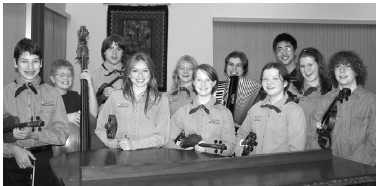
LCMS Western Fiddlers

We are very proud to announce the LCMS performance Western Fiddlers class will be touring Scotland in August 2008! They have been asked to perform at the Aberdeen Youth Festival, and at other folk festivals in the area. To help fund this exciting musical experience and trip to Scotland, the Fiddlers are looking for performance opportunities and will be hosting various fundraising activities over the next year. If you are a violinist interested in joining the program, please note the times have changed this year. The program runs on Wednesdays 4:30 – 5:15 (senior class) and 5:15 – 6:00 (intermediates). If you have any questions regarding the Western Fiddlers contact Roxanna Sabir at Roxanna.sabir@gmail.com , or talk to the school.